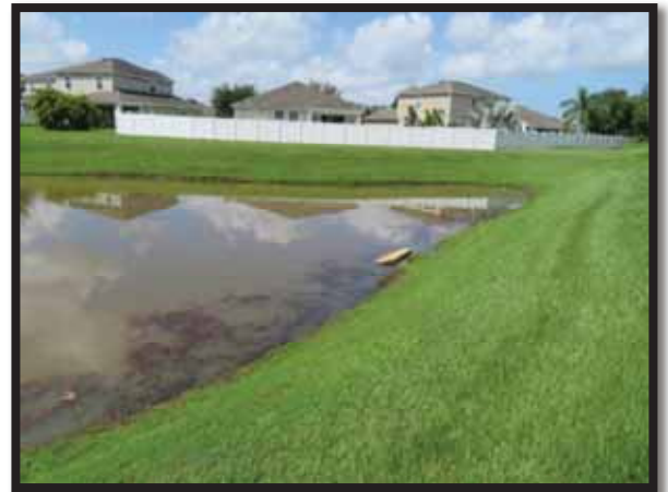
Figure 23 Pond 27 Shoreline Erosion