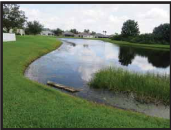
Figure 21 Pond 5 Shoreline Erosion