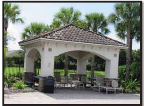
Figure 6 Clubhouse Tile Roof