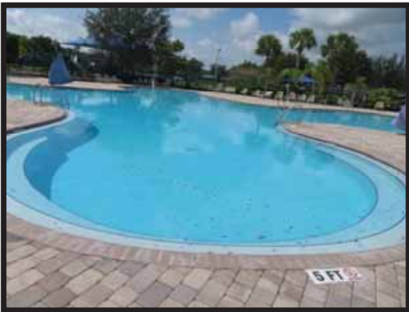
Figure 15 Pool Overview