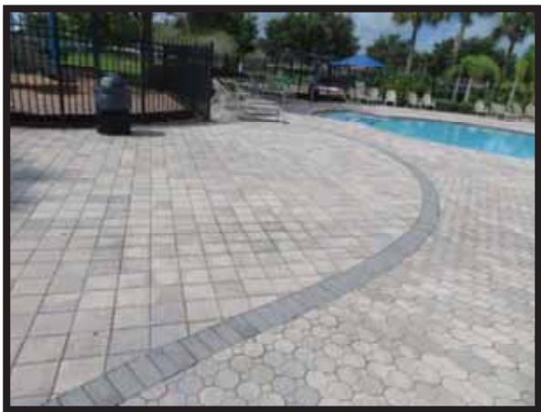
Figure 9 Pool Deck