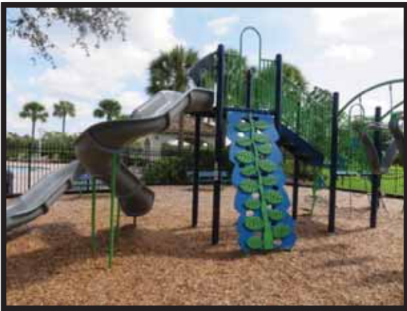
Figure 20 Playground