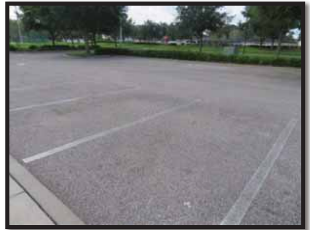
Figure 18 Asphalt Pavement