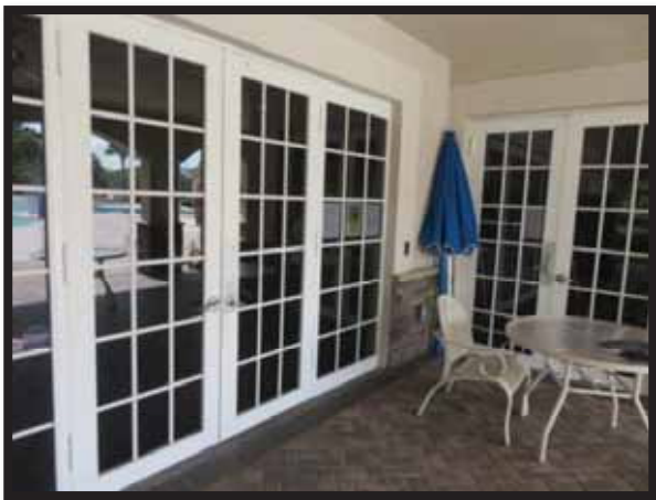
Figure 8 Clubhouse Windows and Glass Doors