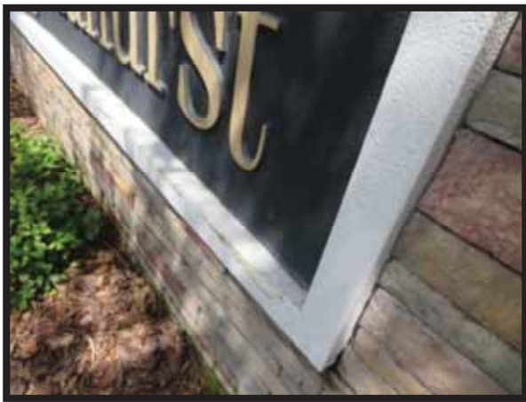
Figure 27 Monument Signage Deterioration