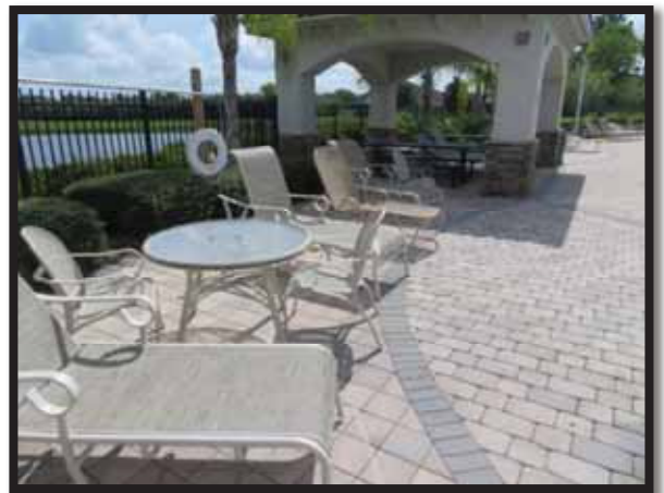
Figure 11 Pool Furniture