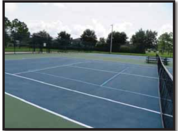
Figure 29 Tennis Court Fence