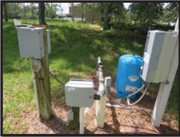
Figure 19 Irrigation Well