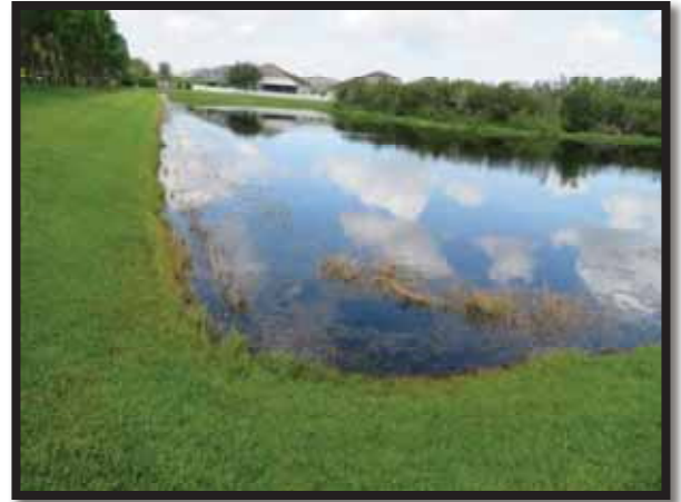
Figure 22 Pond 12 Shoreline Erosion