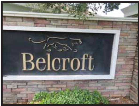
Figure 27 Monument Signage Deterioration