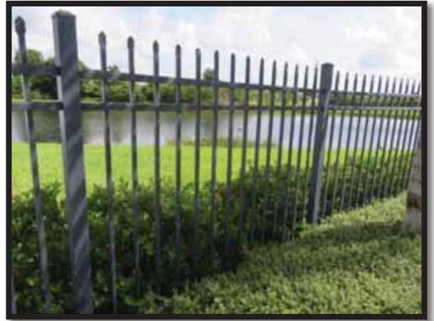
Figure 10 Pool Fence