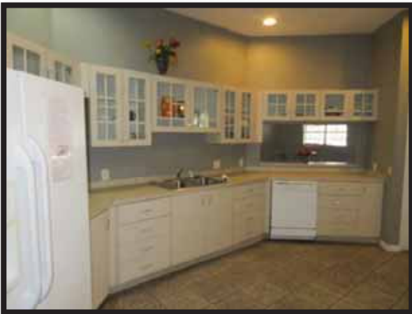
Figure 3 Clubhouse Kitchen