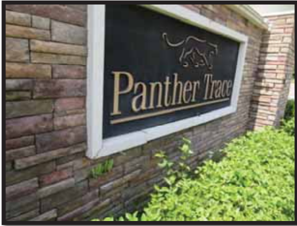
Figure 26 Monument Signage Deterioration