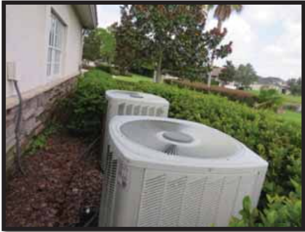
Figure 7 Clubhouse Split System Condensing Units